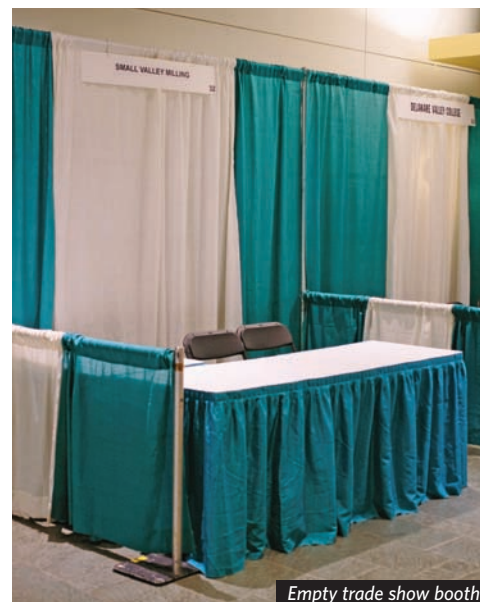
Empty trade show booth

All Trade Show booths include up to two booth only access passes per day (programming and food not included).